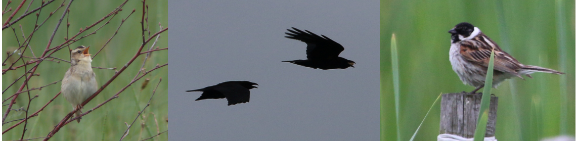
Aquatic Warbler, Raven & Reed Bunting

Subsequently, Alexander guided us to a site where we might expect a breeding Little Owl ( Athene noctua ) in a farm-house, but this time our venture was in vain as there were no signs of its presence. On the other hand, our next visit to another owl species, which Alexander still had in store for us, proved productive when we saw a breeding Long-eared Owl ( Asio otus ) housed in an open nesting box. So, a day full of owls! Eventually the opportunity arose to have our well-deserved lunch (Denis had had to call twice to postpone our arrangement). Two hours later than originally planned, at 15:45 hours, we were enjoying a wonderfully laid out and very tasty meal despite the late hour. Following lunch, we drove on to our hotel and unloaded our bags before setting off straight away to a different marsh area to have another look at Aquatic Warblers. Here, again, we were very fortunate to see them in abundance with brilliant views. At the same time, numerous Citrine Wagtails were flying around us once more. Along the edges of the marsh we went in search of butterflies and dragonflies, there Dick discovered a Black-veined White ( Aporia crataegi ).