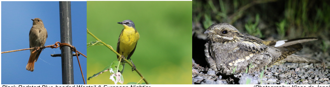
Black Redstart,Blue-headed Wagtail & European Nightjar