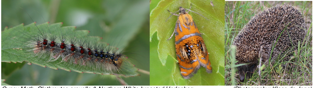
Gypsy Moth, Olethreutes arcuella & Northern White-breasted Hedgehog