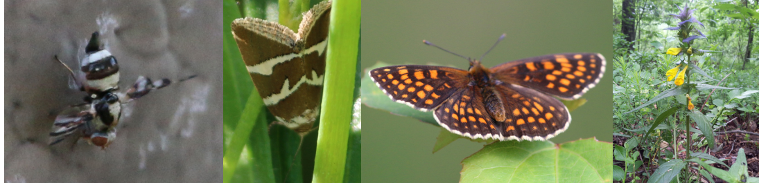
Myennis octopunctata, Silver Barred, Assmann's Fritillary & Wood-cow Wheat