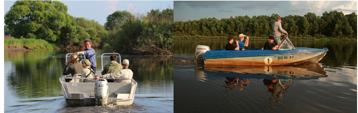
Boat-trip on the Pripyat River