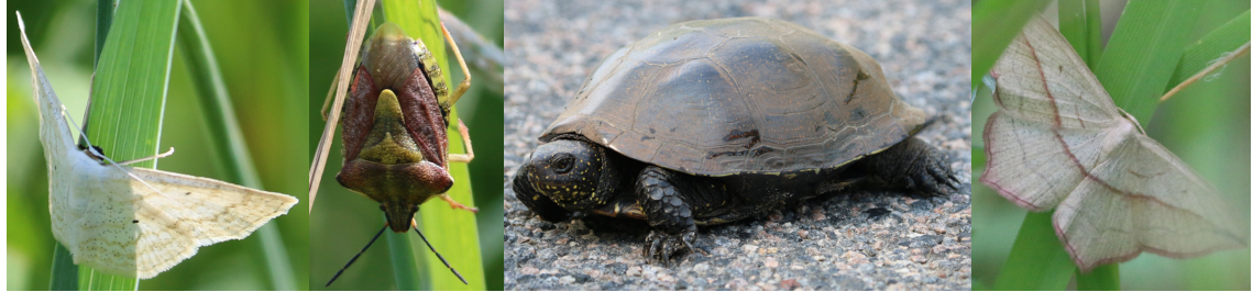
Cream Wave, Carpocoris purpureipennis, European Pond Terrapin & Blood-vein