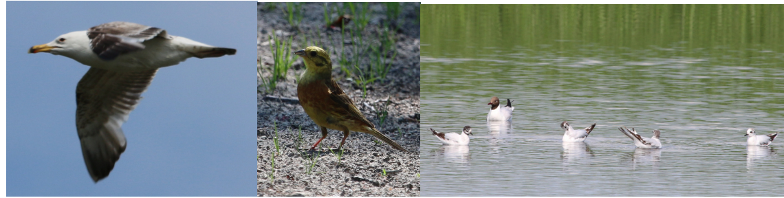
Caspian Gull, Yellowhammer & Little Gulls + Black-headed Gull