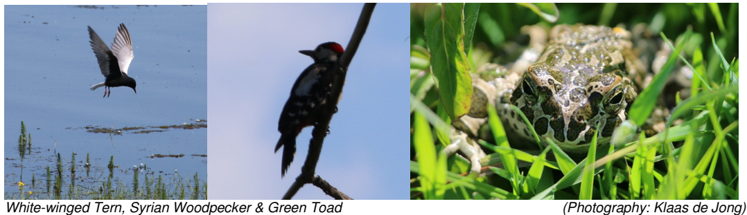
White-winged Tern, Syrian Woodpecker & Green Toad

After breakfast, we proceeded to a different forest housing Wood Warblers (Phylloscopus sibilatrix) and other 'ordinary' forest birds, such as Blackbird (Turdus merula), Songthrush (Turdus philomelos), Robin (Erithacus rubecula), Common Redstart (Phoenicurus phoenicurus) and Blue Tit (Cyanistes caeruleus). Again, we had an indistinct encounter with a Collared Flycatcher. A spectacular observation was the sound of a number of European Bee-eaters (Merops apiaster) flying over but due to the density of the forest we did not get to see them unfortunately. The song of the Red-breasted Flycatcher (Ficedula parva) could also be registered a few times but sadly enough we saw nothing but a glimpse of this magnificent species.