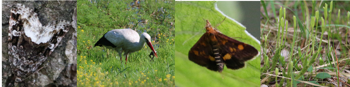
Marbled White Spot, White Stork with frog, Pyrausta aurata & Stag's-horn Clubmoss

This morning we rose very late at about 8 o'clock because our last night, before flying back home, promised to be very short indeed. At our present location, we were still a couple of hours' drive away from Minsk Airport where we had to be present at 7:30 hours, which therefore involved a departure from our hotel at about three o'clock in the morning. We visited other locations in the Sporovo-marshes and occasionally saw one or two Aquatic Warblers, but the number of new species for our trip-total was now on a dramatic decline, giving us the impression that there was not much left to see, bird-wise, and that feeling, in turn, proved to be satisfactory. Notwithstanding all that, we scored a Little Bittern ( Ixobrychus minutus ) and while exploring a range of fish ponds, a Red-necked Grebe ( Podiceps grisegena ) suddenly turned up. Beside that, we were enjoying a huge number of White-tailed Eagles, juveniles and adults presenting themselves in turns, some with fish, etc.