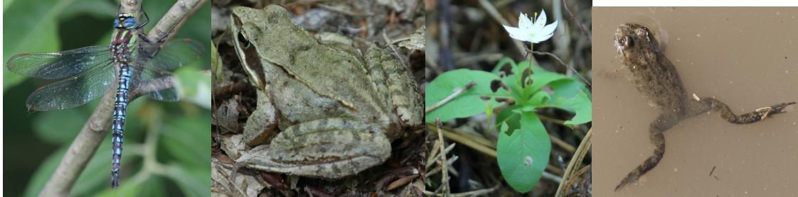
Hairy Hawker, Moor Frog, Chickweed Wintergreen & Fire-bellied Toad

Over dinner, Denis suggested re-visiting the meadow of the day before with an opportunity to score one or more new species for the trip but we preferred to stay in the hotel after such a very long day. Shortly after that I heard a remarkable song coming from the garden outside the hotel. It took me a while, especially with almost every window closed, before I realized that it was the sound of a singing Greenish Warbler ( Phylloscopus trochiloides )! We rushed outside and were able to locate the bird in question easily, offering us an unexpected opportunity to admire it for a long time. What made it very special was the fact that only this afternoon Denis had remarked that this particular species was non-existent here and could only be found in the north of Belarus. Once again, he had to call his friends from the local ringing station to report a rarity. Within half an hour, a number of local birdwatchers had gathered in the garden to twitch this scarce warbler. It sang and called repeatedly almost till midnight, also responding very well to Arie's mobile phone.