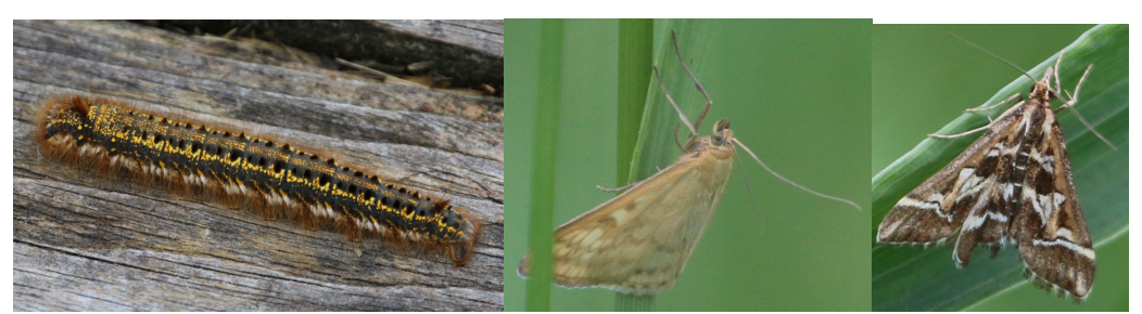
Drinker, Meccyna flavalis & Diasemia reticularis