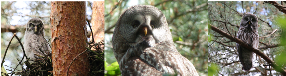
Juvenile & adult Great Grey Owl

adults was sitting on a branch close by, clattering its beak as a warning sign. Alexander climbed up in the tree to fetch the youngster for ringing purposes, but he had to endure several attacks by the adult, forcing him to hold on to the tree with great care to prevent him from falling down. All in all, quite a show!