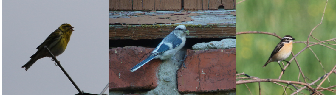
European Serin, Azure Tit & Whinchat

and, perhaps the rarest of the lot, the East-European subspecies of the Jackdaw ( Coloeus monedula ), also known as the Russian Jackdaw ( Coloeus monedula soemmerringii ), which has a whitish area at the nape. On our arrival at the hotel at about 20.00 hours, the European Serin ( Serinus serinus ) and the Black Redstart ( Phoenicurus ochruros ) were singing in the garden.